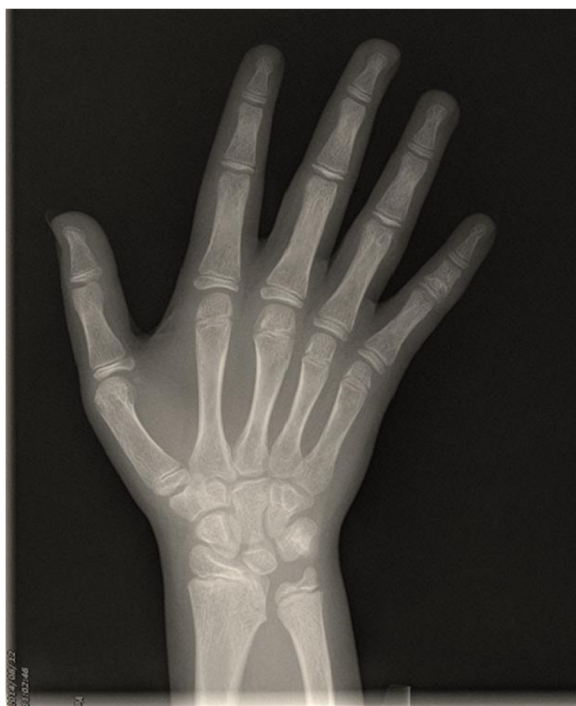
Fig. 3 Bone age of the patient

Pituitary magnetic resonance imaging and chest X-rays showed no abnormalities. The bone age was approximately 13 years of age (Fig. 3). Ultrasound examination of the uterus and double attachment revealed an approximately 1.1 \times 0.9 \times 0.6 -cm hypoecho, similar to a