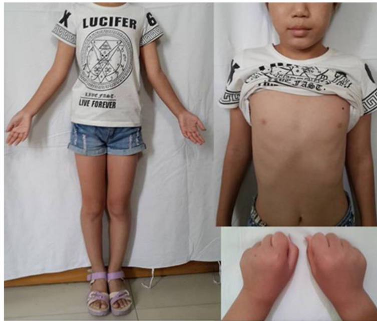
Fig. 1 Characteristics of the patient

14 and had his first spermatorrhea at 18 years. Her mother was 157 cm in height, and her menarche began at the age of 12 years. Both parents stated no history of other hereditary and infectious diseases.