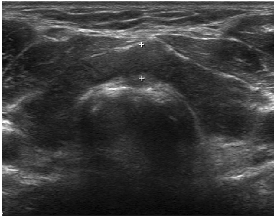
Fig. 3 Transverse view of thyroid sonography revealed marked heterogeneous echotexture of both thyroid glands